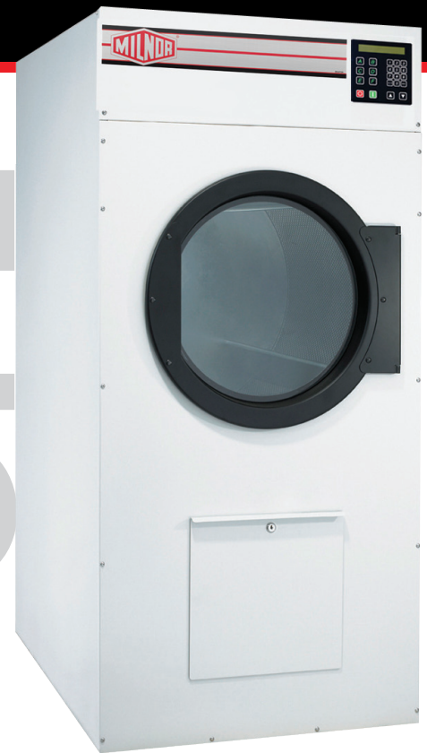
M30V OPL Dryer